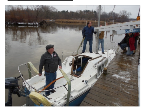
Some pics of the Bobby G being hauled.