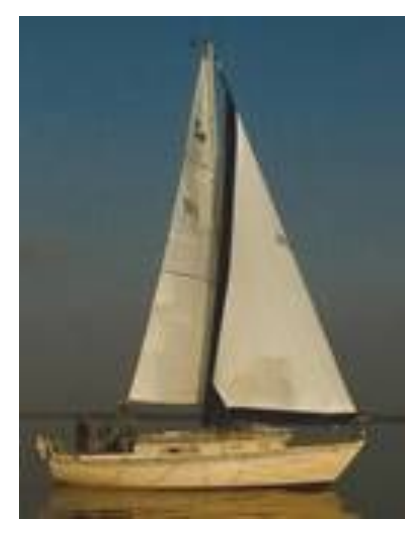
Last out-First in: The Bobby G!