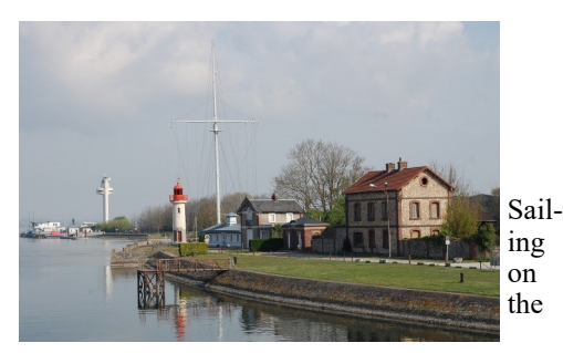
Seine, near Vernon.