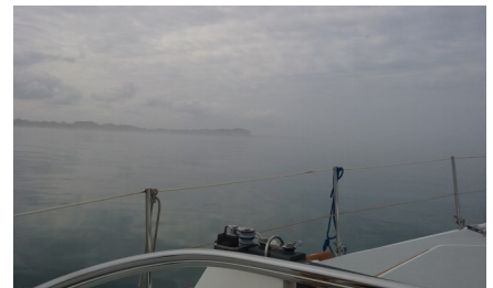
Into the Fog!