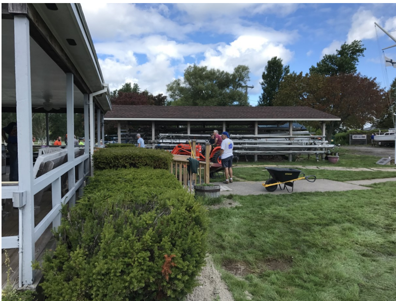
Reminder of past work. Submitted by Tomj Rossi