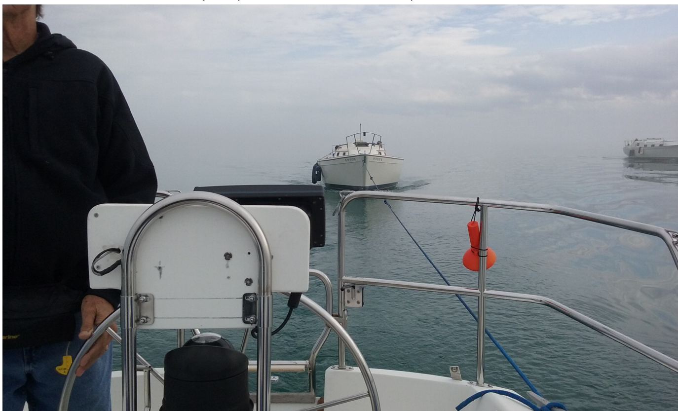
Towing by Trish Beneway