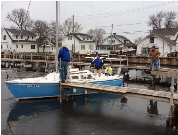
Moving the Bobby G. through the ice pack in order to haul it out. Ice was 2-4 inches thick.