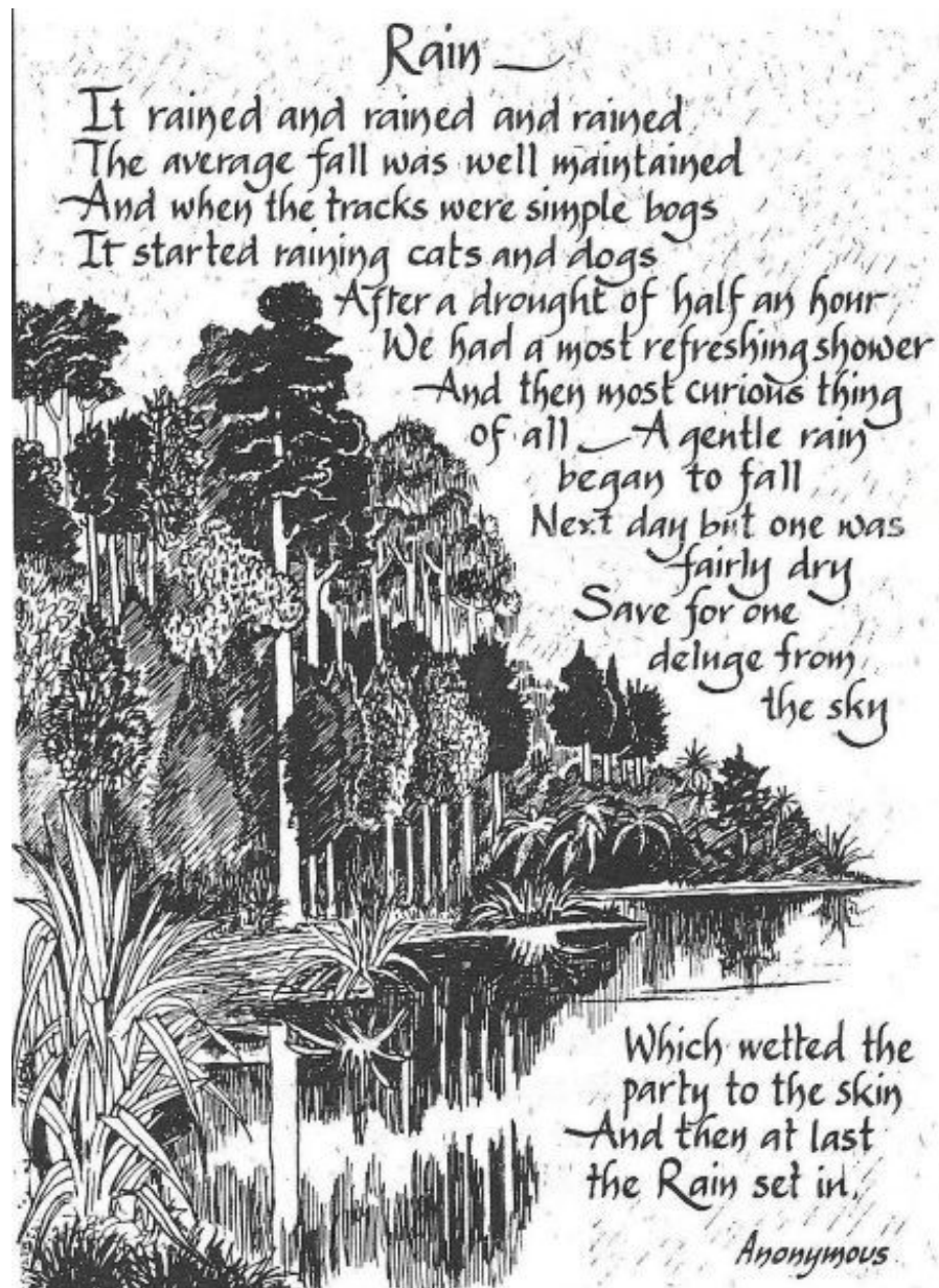
The New Zealand Rain Poem.