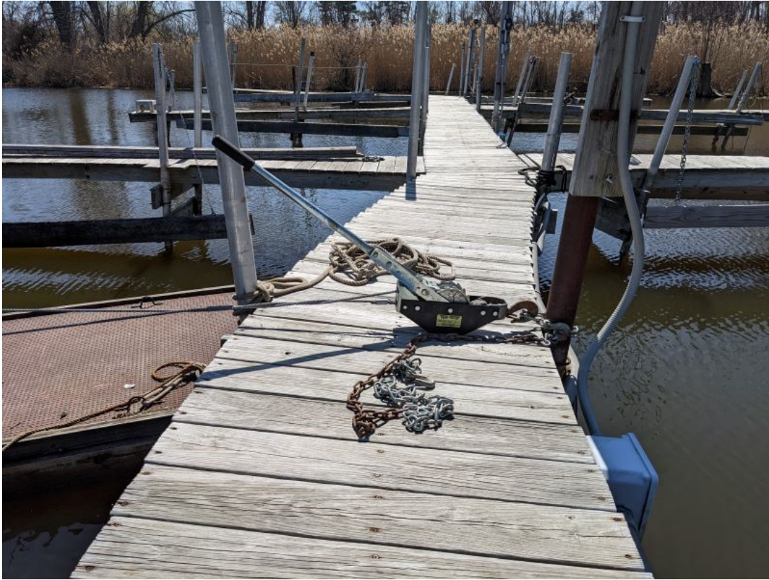
Attachment to Fleet Captain's report (see text, page 2)