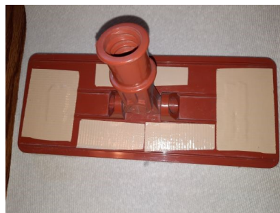
Trimmed pad with double sided tape applied top side