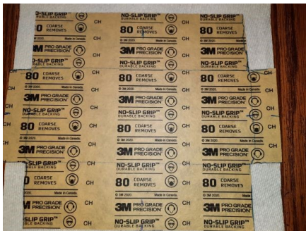
Sandpaper with corners notched out