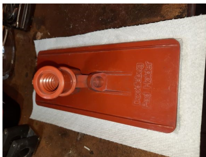
Pad holder and pad before trimming

Double sided tape: https://www.lowes.com/pd/Shurtape-1-88-in-x-12-Yard-S-Blue-Heavy-Duty-Duct-Tape/3014450