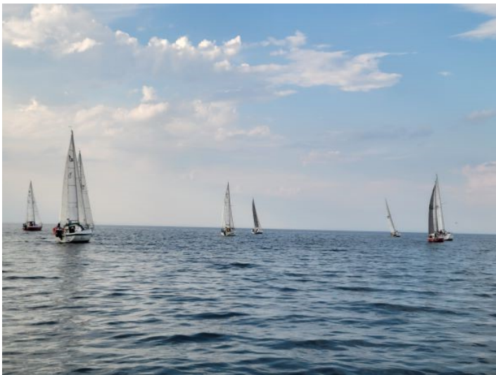
Submitted by Steve Locke

Submitted anonymously (and for good reason)