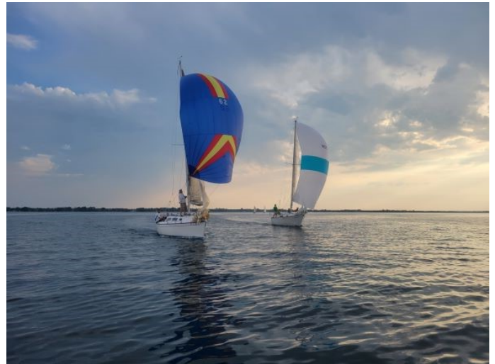
Downwind, Wednesday evening race.