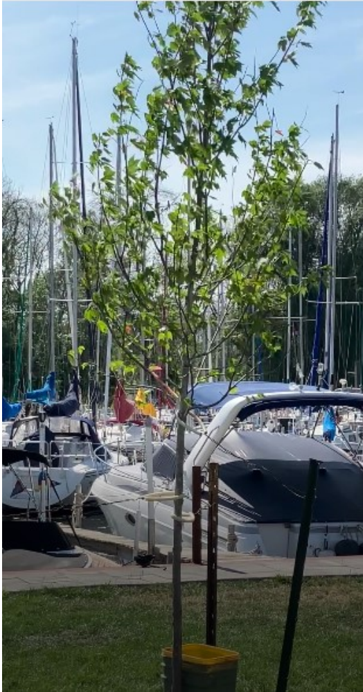
Donated Tree #2