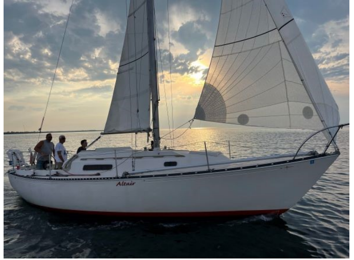
Altair at the finish line.