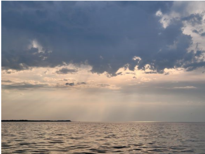
A BYC Sunset