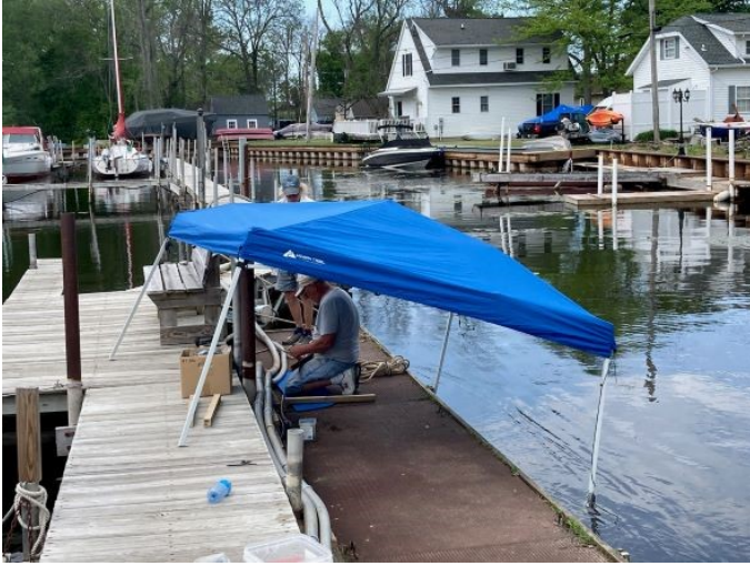
Electric System Upgrade in Progress