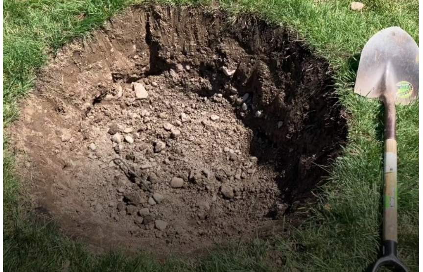
Donated Hole #2

(Editors note: This hole was obviously dug up from elsewhere and moved to BYC)