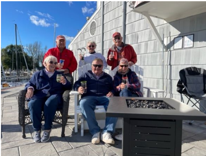
The Friday afternoon wine group is not ready to give up.