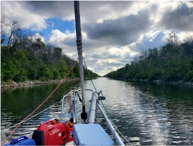
Transiting the Murray Canal