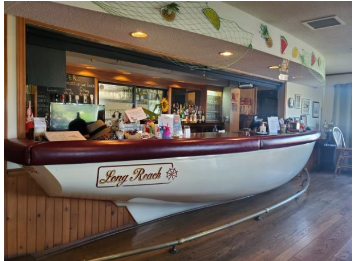
Bar at Bay of Quinte YC, a 22 ft Alberg split in half.