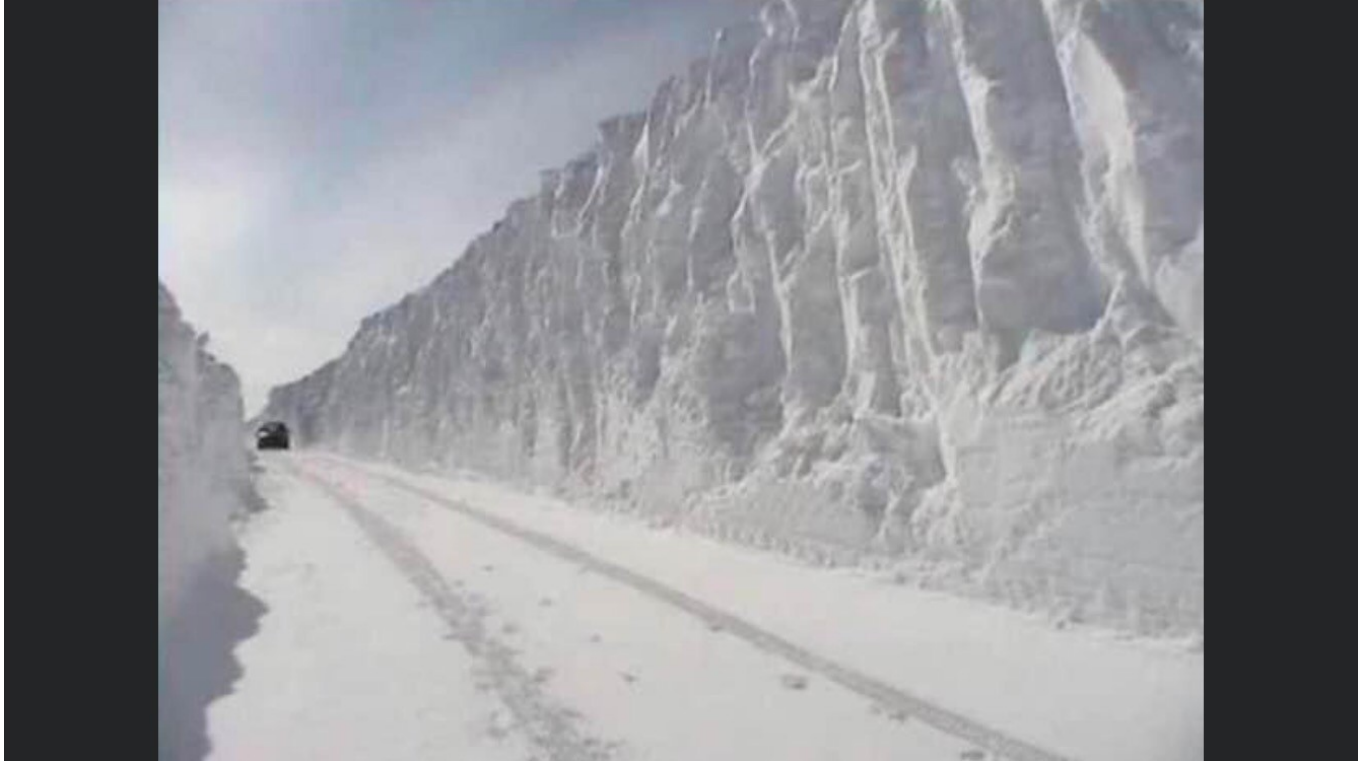
Clearing the road for the crane's arrival