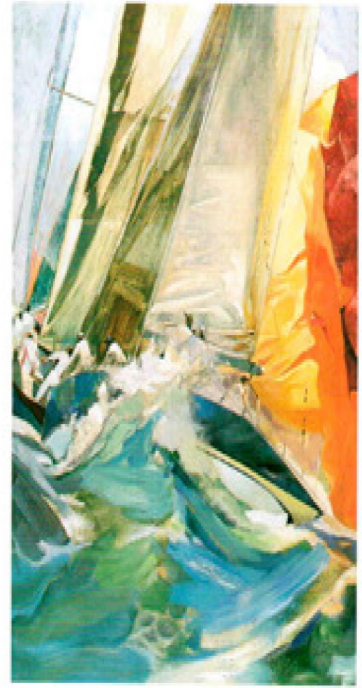
AT THE MARK

24" X 35" $25 Unsigned 725 Signed & Matted