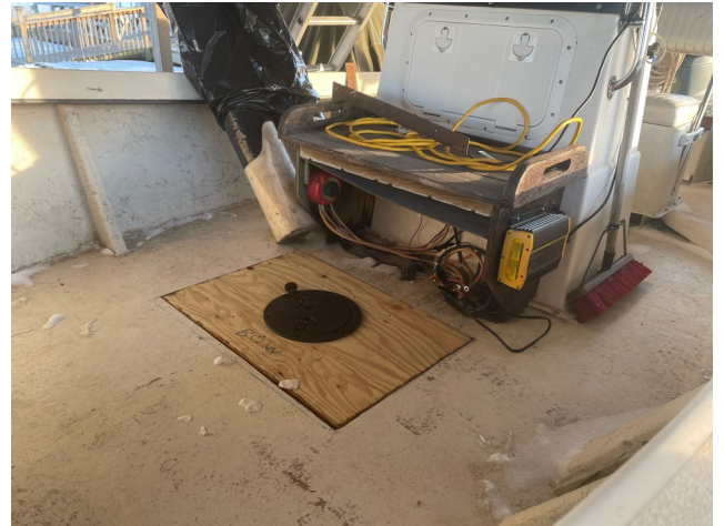
Work continues on rebuilding parts of the old committee boat, The George Dunn, for dredging operations this Spring. Matt Keene has opened up the floor, reinforced bad parts and is now preparing to fiberglass new parts in.