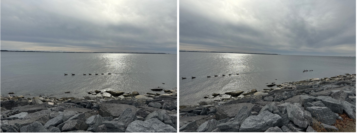
Kingston looking out at wolf island on the left. Amherst island on the right and the gap to the open lake.

Tír na nÓg: Irish pub on the water. Kingston. Leave it to me to find a great old school pub.