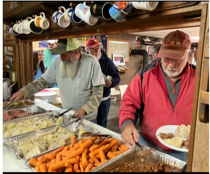
Submitted by Jeff Spring