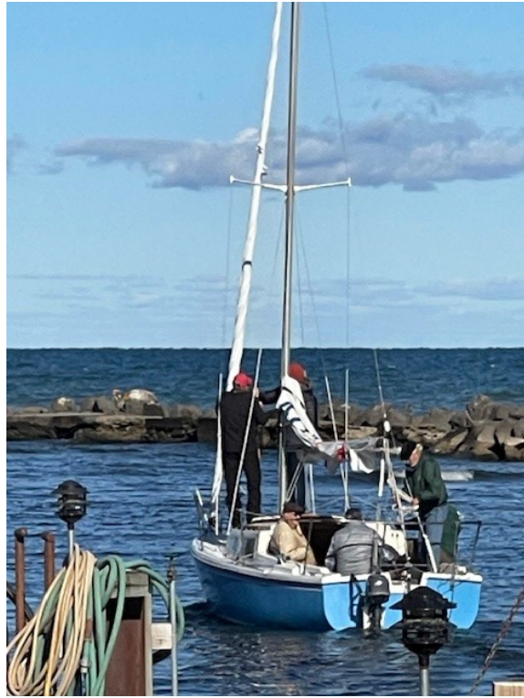
The club is closed and the bar is open. Submitted by Donne Maxwell