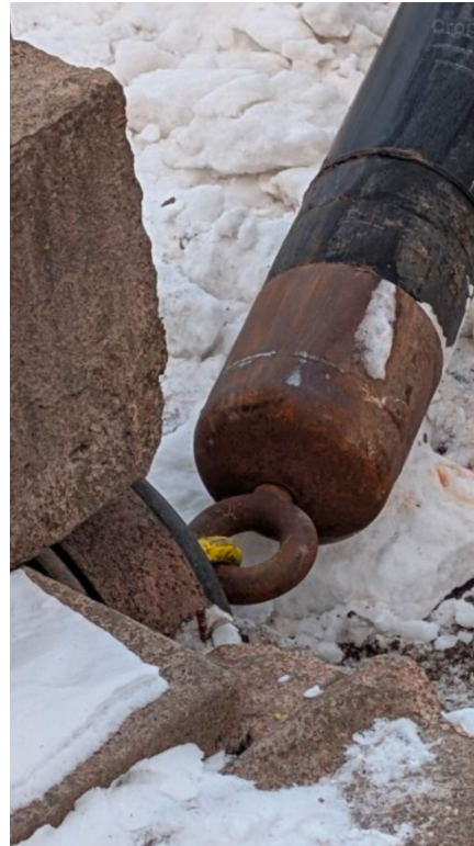
Some things can only be done along the lake in the winter. Town of Hamlin feeding a new 300 ft drainage pipe thru an existing damaged conduit off Westphal and Sandy Shore Drive the week of January 13. Submitted by Jeff Spring.