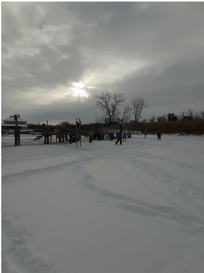
Submitted by Jim Balmer