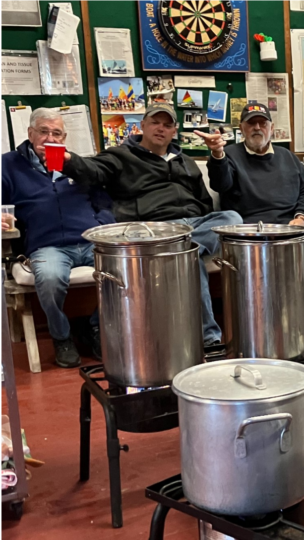
Submitted by Jeff Spring